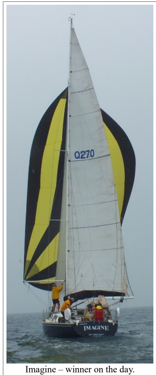
Imagine – winner on the day.

Prior to the last leg, a decision was wisely made to shorten the course as the wind dropped and the tide reached its maximum. Even so the last few finishers used the wind to get up-tide of the finish line and drift down to it rather than positively racing for it. Rosie lost the battle with tide and dying wind to score a dnf. Imagine was a clear winner, both across the line and on handicap. Handicap results were: Imagine, Boomaroo, Warrior, Tintagel, Valentine and Tiercel with Rosie just missing out with dnf. The last three finishers were within a minute of each other.