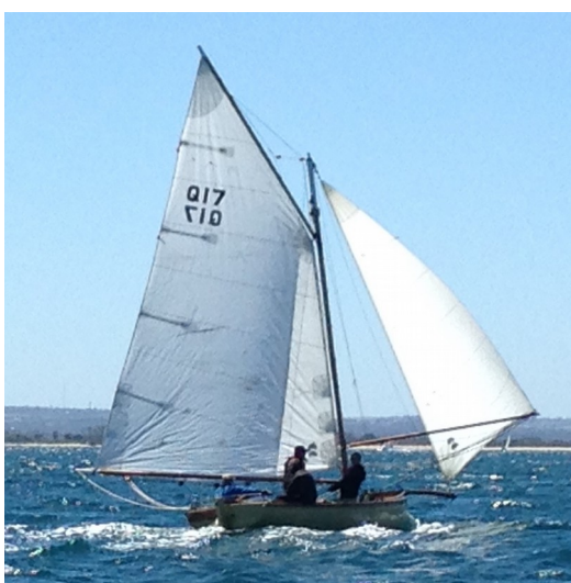
Warrior powering down-wind