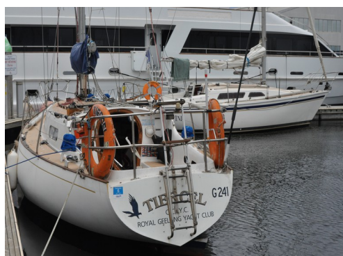
Valentine and Tiercel prepared for quick getaway.

It was close to the laid buoy at the exit from Symmonds Channel that the divisions converged following the 10-minute separations and, from here on, Sundance clawed back time after struggling on the slow downwind leg. It was also here that the wind got up