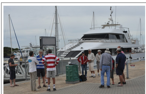
Briefing - and new Committee boat (under negotiation ?!) in background

Another day of contrasts. Briefing at 11.30 saw skippers and crew of 6 vessels plus members of Queenscliff Coastguard present for the occasion, with a prospect of steady southerlies around 15 to 19 knots. Briefing included thanks to the coastguards for laying the buoys and standing by on the water and appreciation of Swan crews past and present. Vessels signed on were Imagine, Sundance, Boomaroo, Tiercel, Valentine and Tintagel.