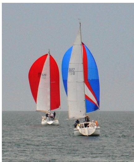
Valentine chasing Boomaroo in a light breeze.

quickly to the forecast levels around 19 knots, with relief that spinnakers had just been dropped.