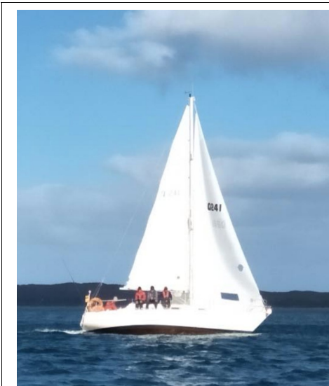
Tiercel on another (drier) day.

With a fairly strong flood tide and variable winds the main challenge was balancing tide and wind. A wise decision to shorten course made the course West 3, West 4, QA. West 3, QA (finish). The finish around 1.30 allowed crews to get ashore before the rain started in earnest. Result: Tiercel, Valentine (by seconds from) Sundance.