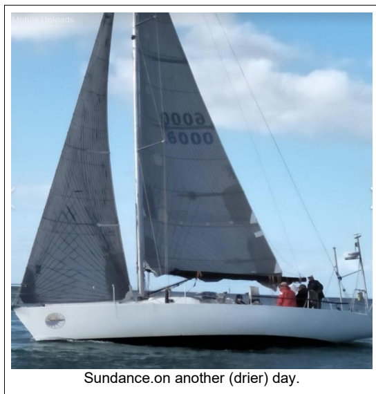
Sundance.on another (drier) day.

Another "occasional" winter race report, to celebrate the fact that it finally happened – and despite a very iffy forecast. The great thing being that at least some crew could change vessels and